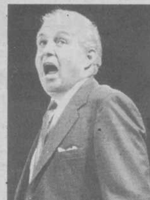
UNLV Head Coach Rollie Massimino

any obstacles that would place a dark cloud over the university.