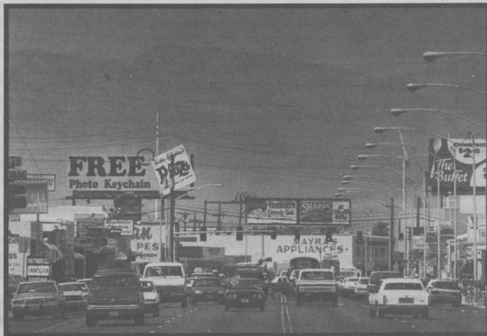
To relieve traffic, Sen. Harry Reid has brought home over $800 million of our gasoline tax dollars to improve roads and highways throughout Nevada.