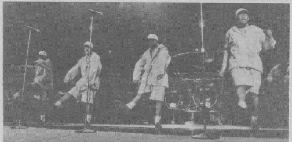
Boyz II Men, is shown here, when they opened up for Hammer in June, at the Thomas and Mack Center.