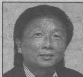
Clem Lue Yat Interlocking Hairweaving