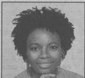
Amazon Smiley Finishing Touches Braid Designs Goddess, Egyptian and more