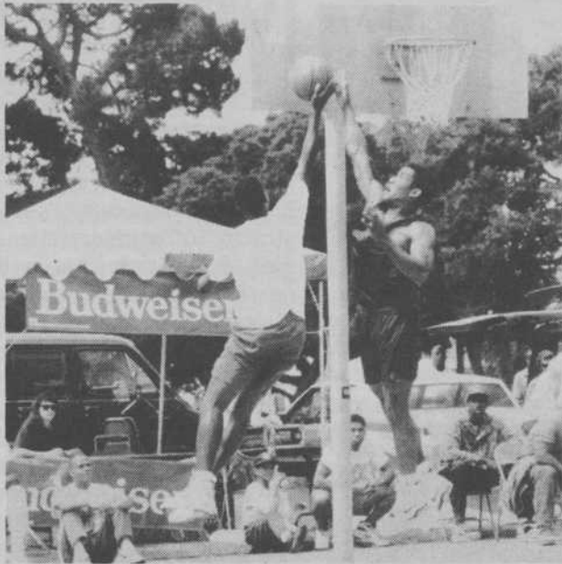
BUDWEISER SUMMER ALL-STAR BASKETBALL TOUR — Top teams will vie for the National Budweiser 3-on-3 Basketball Championship at Venice Beach on August 22 and 23. A special "slam dunk" competition will also take place on Sunday, August 23, beginning at 1 p.m.

Play will be divided into three divisions: open; under six feet; and recreation. There will be four spots in the tournament held for local Los Angeles teams. The rest will be filled by championships of previous tournaments.