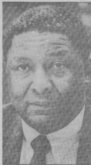
SENATOR JOE NEAL

The Improved Benevolent Protective Order of Elks of the World is a patriotic fraternal Order, the largest of its kind in the United States. Within their jurisdiction they have an active membership of more than a half million who have worked ardently for 92 years for the rights of all people.