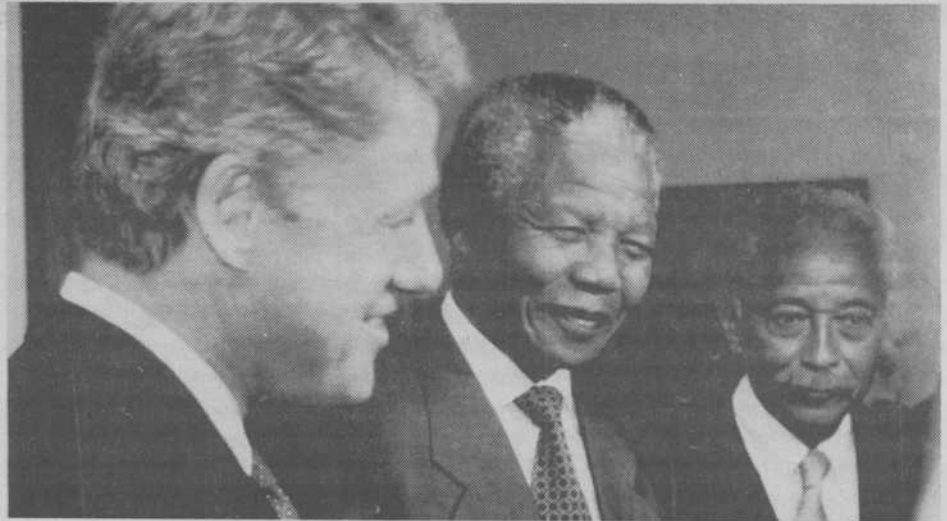
DEMOCRATIC PRESIDENTIAL NOMINEE Gov. Bill Clinton (left) met with South African leader Nelson Mandela during Mr. Mandela's visit to New York to address the United Nations. This was during the week of the Democratic National Convention. New York Mayor David Dinkins (right), who headed a black business delegation to South Africa earlier this year, participated in the meeting.