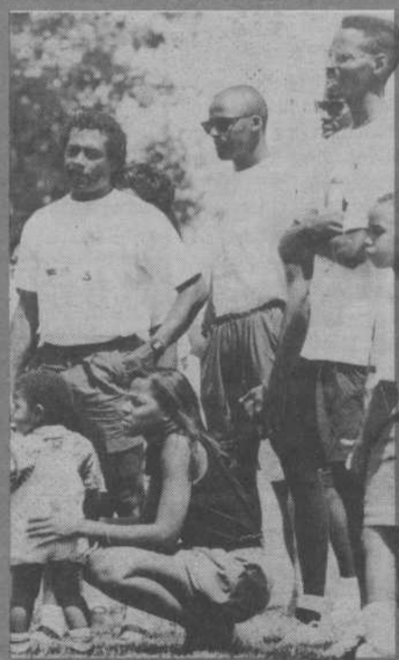
Several generations of African-Americans came out to Lorenzi Park to participate in fun of the Juneteenth celebration.