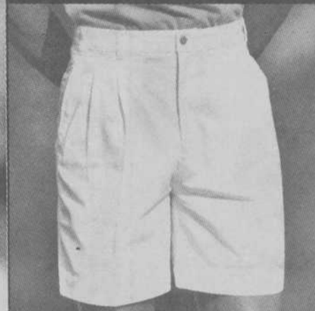
$25 LEVI'S DOCKERS

Left: Mossimo® active short combines the soft, comfortable good looks of brushed twill with an elasticized, drawstring waist. Made of pure cotton, it's available in a variety of colors. Sizes M-L-XL. $36.