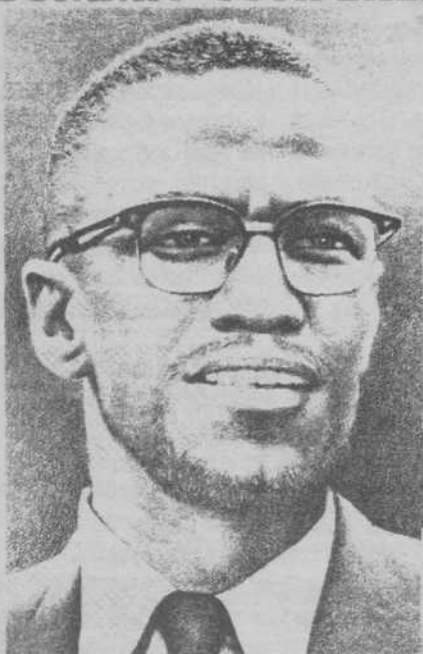
MALCOLM X LUNCHEON TO BE HELD SATURDAY, MAY 23, 1992.

The third annual African-American Summit Conference activities will commence on Friday, May 22, 1992 on the campus of the University of Nevada, Las Vegas. This year's conference theme, "AFROCENTRICITY - THE WAY FOR AFRICAN-AMERICANS" has pulled