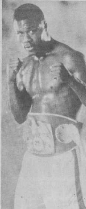
WORLD BOXING ASSOC. (WBA) WELTERWEIGHT CHAMPION MELDRICK TAYLOR

Taylor (29-1-1, 15 KO's), Philadelphia, PA, will be making a bid for his third world title in three different weight classes.