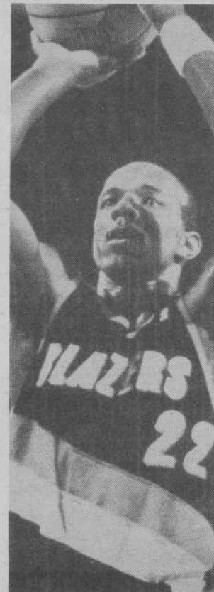
CLYDE DREXLER LED ALL SCORERS WITH 26 POINTS