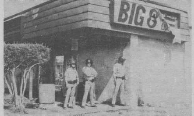
Criticized for not coming to the rescue of the Nucleus Plaza complex during the night, the police stand guard over a empty shell of a building.