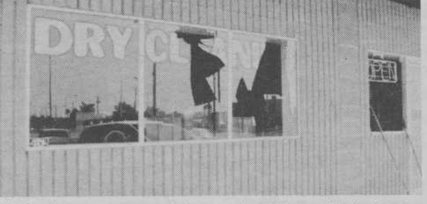
No business was spared the wrath of thugs plundering for money and property.