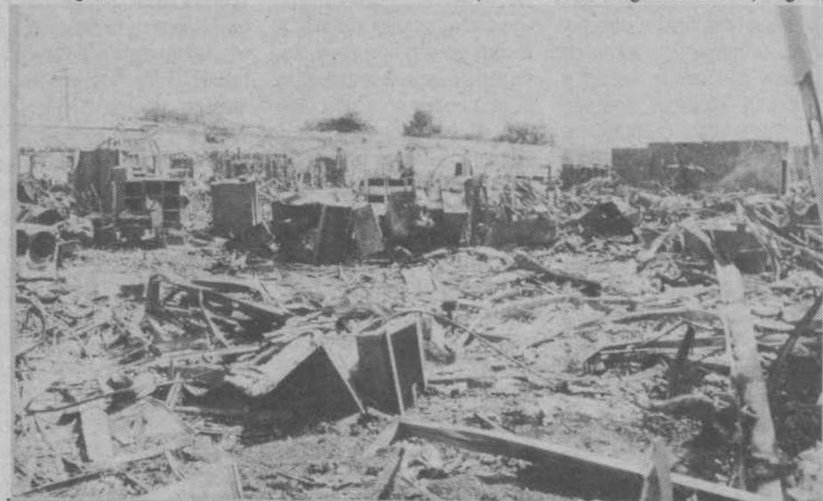
Charred and burned rubble is all that occupies the Nucleus Plaza Shopping Center after vandals set fire after a night of looting and destruction.

Police also stated they don't believe their critics understand how serious the situation was. Franks added that most of the attacks were the work of gangs, who he referred to as, "yellow bellied rats who stood with young children around them, firing at police, knowing we couldn't fire" (See West Las Vegas to rebuild, Page 7)