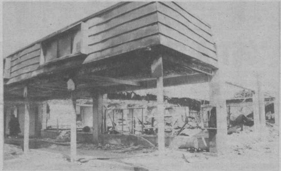
The foundation of the pharmacy is all that remains to tell what hell broke loose.

The police department, on the other hand, was angered by the accusations that they improperly handled themselves during last week's uprising.