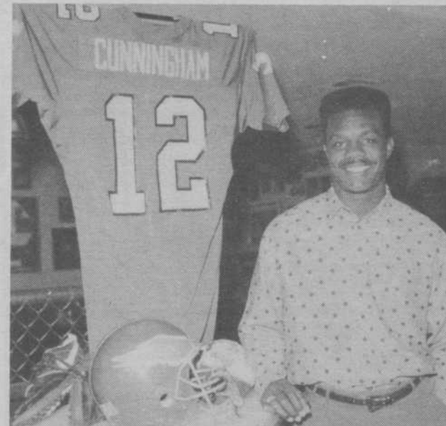
RANDALL CUNNINGHAM, QUARTERBACK FOR THE PHILADELPHIA EAGLES, POSES WITH HIS COLLECTION

Cunningham's memorabilia joins a wide variety of sports history at LJ's, including the all-white outfit worn by Las Vegas tennis star Andre Agassi during the 1991 Wimbledon Tournament in England, autographed jerseys from the starters on UNLV's 1990 national championship basketball team, auto-