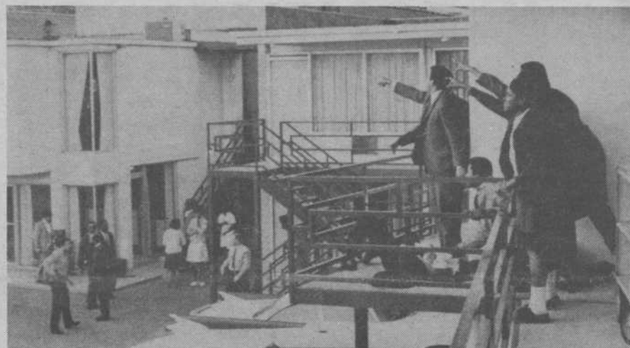
Dr. Martin Luther King Jr.'s staff point in the direction of gunfire that killed the civil rights leader at the Lorraine Motel in Memphis on April 4, 1968

FOR A REPORT FROM THE MARTIN LUTHER KING JR. COMMITTEE OF LAS VEGAS, SEE PAGE 5