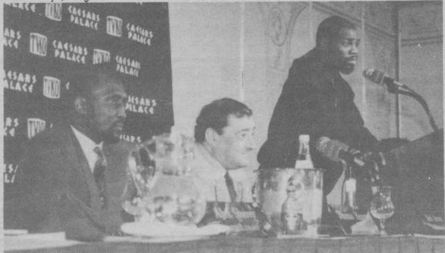
The three major players in the light heavyweight title bout at Caesars Palace in Las Vegas, Iran "The Blade" Barkley, at the podium, promoter Bob Arum, seated in the middle, and the current WBA light heavyweight title holder, Tommy "Hit Man" Hearns.