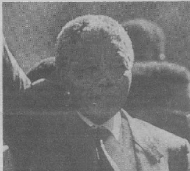
ANC LEADER, NELSON MANDELA

But, despite the good news, Mandela still expressed to reporters, "Apartheid is still very much alive. I still cannot vote in my own country."