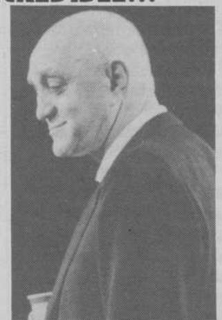
Jerry Tarkanian looks on as 18,000+ showed up at the Thomas & Mack Center to bid a final farewell to the long-time UNLV Head Coach.

have a hard time talking when I get real emotional. Going into the game I was alright, it was after when I got emotional. It really started when I watched (See Absolutely, Page 15)