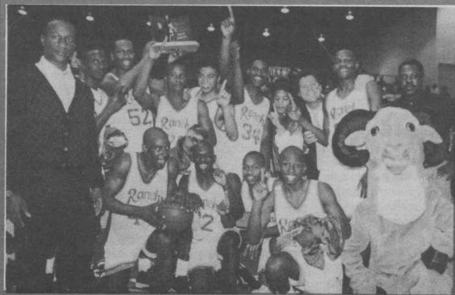
RANCHO RAMS — 1992 CLASS AAA SOUTHERN CONFERENCE CHAMPIONS SEE STORY PAGE 14

NVCOM571289 UNLV LIBRARY ATTN: CAROL 4505 S MARYLAND PKWY LAS VEGAS, NV 89154