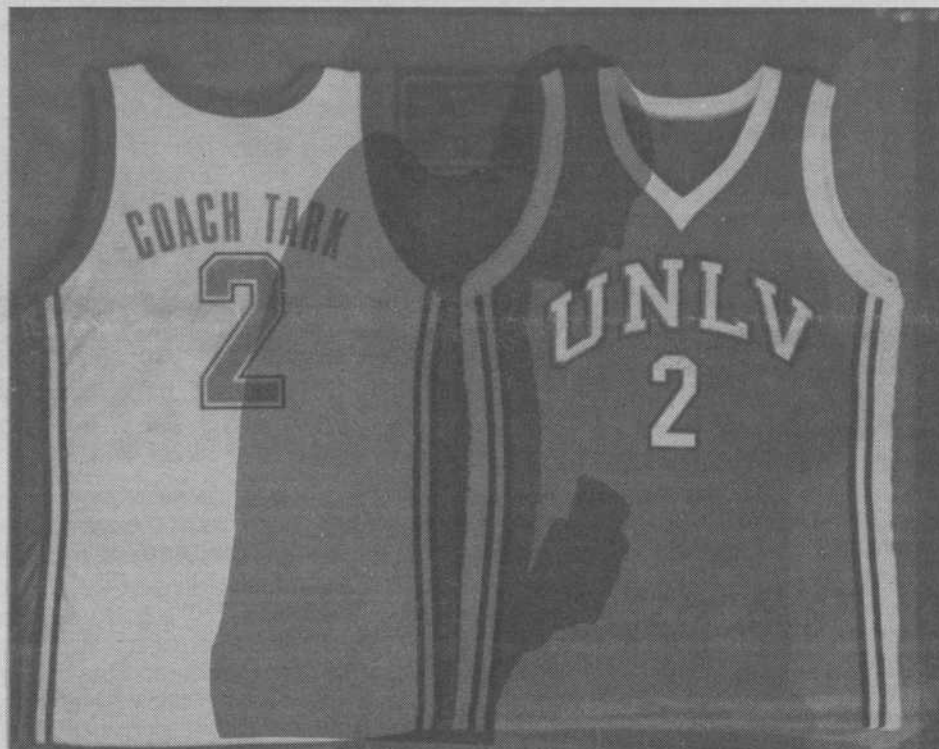
Although never worn by a UNLV player, Jerry Tarkanian's collegiate number was retired Tuesday evening at the Thomas & Mack Center