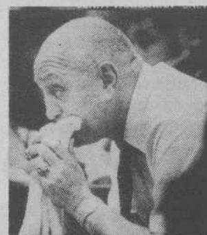
WILL TARK BE CHEWING THE TOWEL DURING NCAA TOURNAMENT?

After all the upsets this past week, UNLV may sneak into the top 10, next week. It would be hard for the selection committee to deny a top 10 team a berth into the tournament.