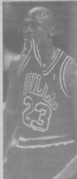
Hungry for another title, Michael Jordan currently leads the league in scoring with a 29.7 avg.