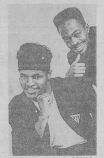
IN DEMAND OF SUCCESS

Anybody that tries to take so many things on at one time, as well as attend college, is either crazy, or hungry for success. This group is in Demand Of