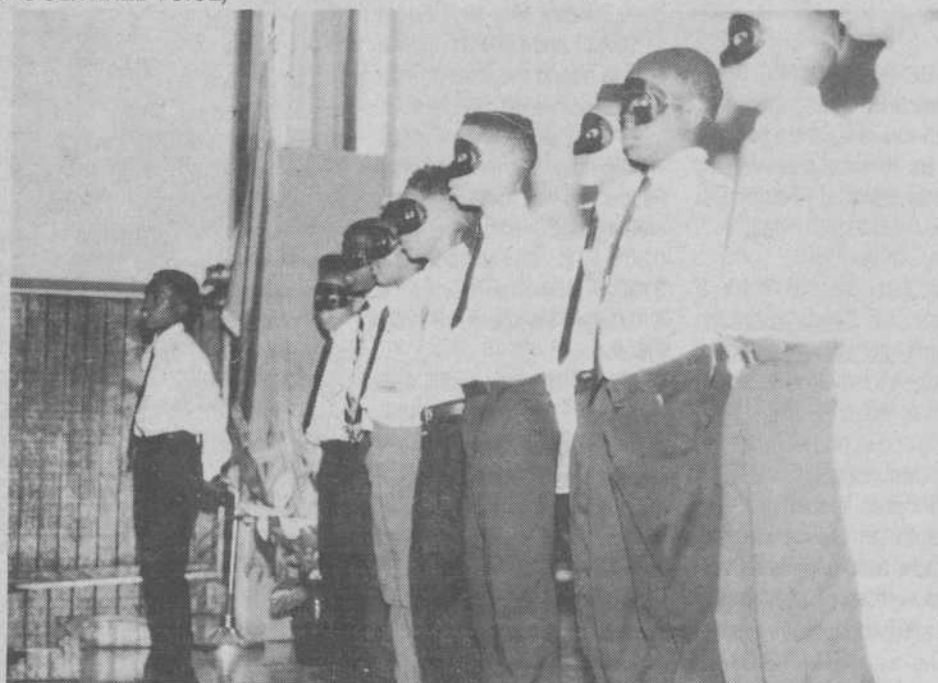
Jr. Kappa Leaguers remain masked until ceremony for acceptance is completed.