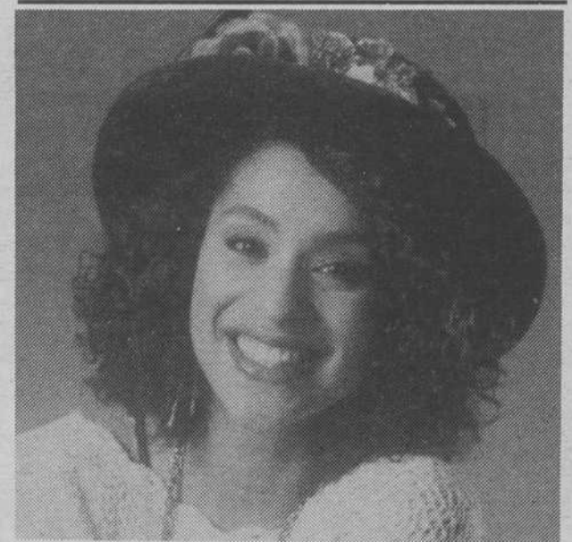
Karyn Parsons stars in NBC's comedy series "The Fresh Prince of Bel-Air" — Karyn Parson stars as Hilary Banks, a spoiled, would-be brat packer and celebrity seeker, in NBC-TV comedy series "The Fresh Prince of Bel Air" on Monday nights.