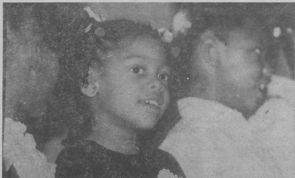
In Accordance with this year's theme "Living the Dream to Save the Children", young vocalists of the Second Baptist Choir filled the church with song and joy.