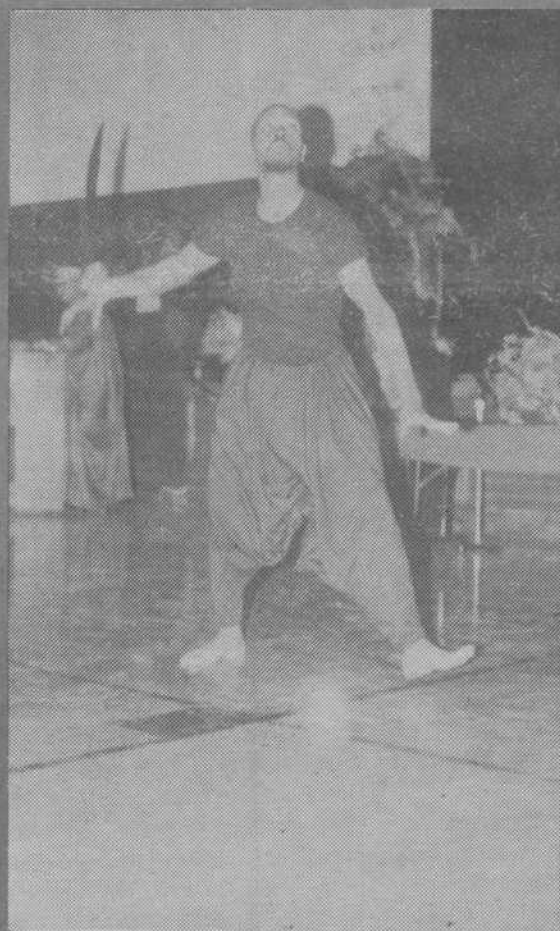
SEE PHOTOS PAGE 5