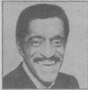
be renamed for Davis. The new amphitheater which will be built near the west end of

Sammy Davis died, to have a street named to honor him, have become bogged down in red tape and problems. The city committee formed to study the renaming of a street cites the choosing of a street, coordination among various government groups, and agreement from companies on the street to be renamed as some of the problems entailed in the delay. The committee said it will be months before a street can