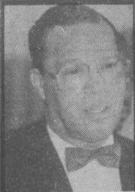
Minister Louis Farrakhan

MINSTER LOUIS FARRAKHAN SPEAKS BEFORE OVER 3,000 AT CASHMAN FIELD