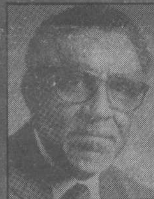
Rev. Joseph Lowry

NAACP FREEDOM FUND BANQUET AT BALLY'S OCT. 27