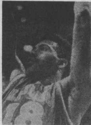
'Hot Rod' Williams

The Cavaliers wanted Seattle to send them Xavier McDaniel and Nate McNillan for Williams, who averaged 16.8 points and 8.1 rebounds per game last year.