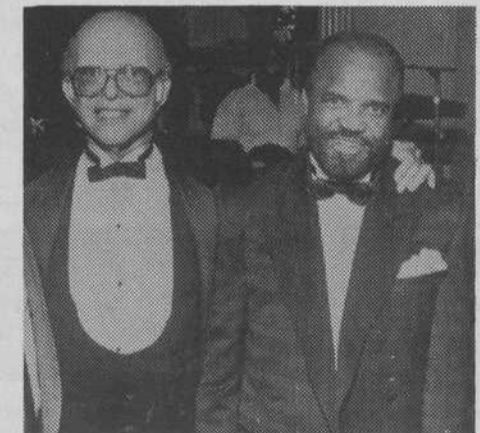
Jack the Rapper with Berry Gordy

MOVING ON UP: -- It's a promotion of sorts for Nipsey Russell. When he appeared in the TV series "Car 54" he played a switchboard operator. In the up-scheduled movie, he's now a captain. Then the Ossie Davis charac-