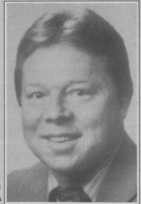
EX-MARINE VIETNAM VETERAN

We have become a community that lives in fear of its own police force.