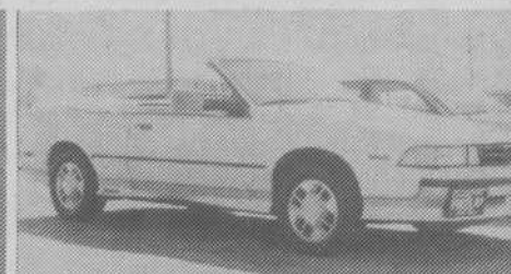
'89 Chevy Cavalier - Z24 convertible A/C - Body Kit Was $14,400 Is $12,900