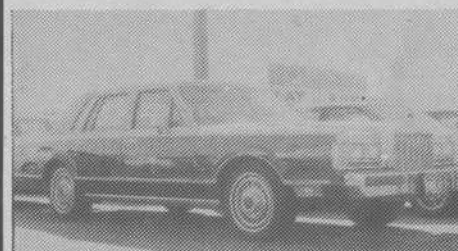
'86 Lincoln Town Car - Fully powered - Great shape Was $11,490 Is $9,990

*First 15 test drivers receive 2 complimentary tickets to party with "The Family Stand" at Calamity's Concert House.