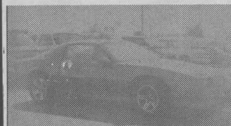
'87 Chevy - Z28 - T-Top - A/C - Leather Interior Was $11,490 Is $9,990