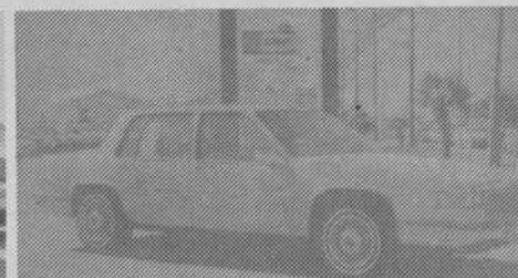
'86 Caddy DeVille - Clean - Low Mileage Was $12,490 Is $10,990