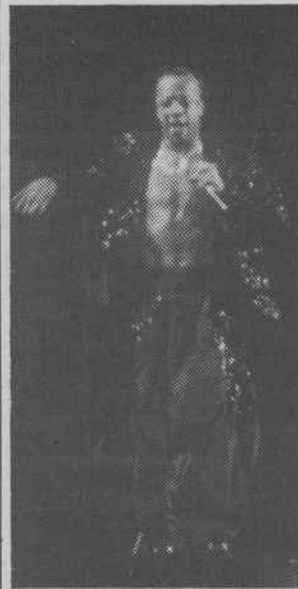
MC Hammer brought the house down at the Thomas and Mack Center last Friday night. He is shown above as he "did his thing."