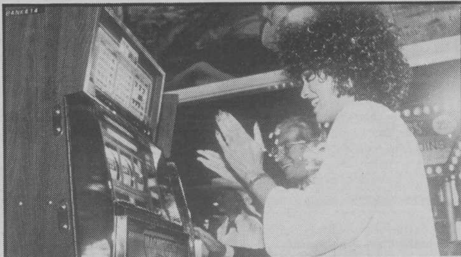
CELEBRITY CITY --Singer Marilyn McCoo and Mr. Blackwell (worst dressed list) cut up during Silver City Casino's Third Annual Celebrity Slot Tournament. More than $12,000 was raised to benefit the Children's Miracle Network Telethon airing locally on June 2, 1990, beginning at 6 PM on KVBC-TV3.