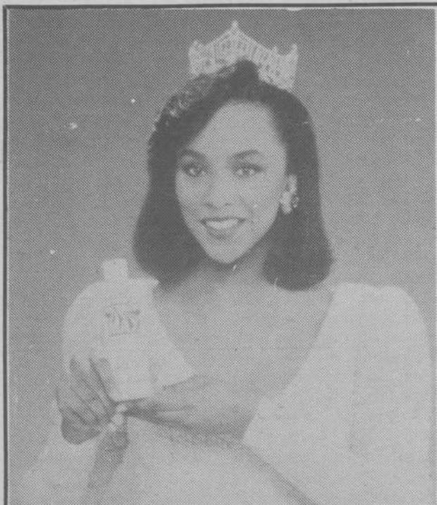
Miss America 1990, Debbye Turner signs with Lustrasilk Corporation of America to endorse MoistureMax brand.