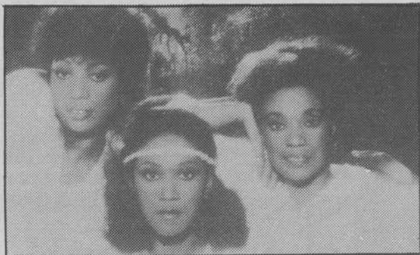
The Pointer Sisters

The recording industry gave the Pointer Sisters their first big break. Singing everything from jazz scat to