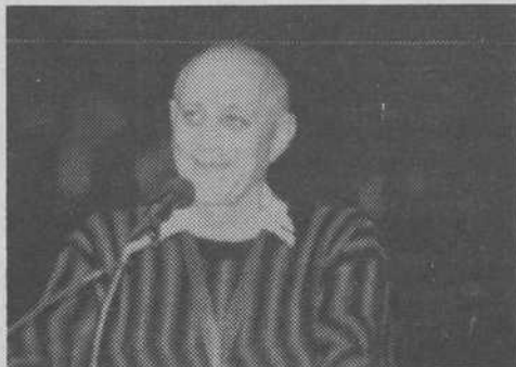
"Tark the Shark" grins at the celebration rally...