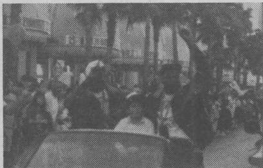
...Rebels on parade...