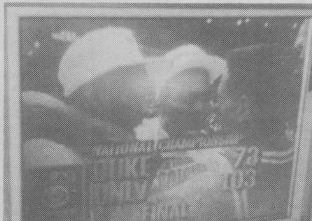
...The final score says it all