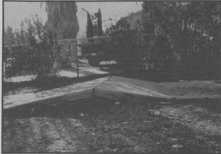
SCENES FROM WINDSOR PARK...A buckling sidewalk...