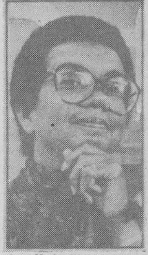
Marian Wright Edelman I recently had an oppor-

understand that the civil rights movement was only one phase of our long struggle for justice.