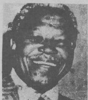
Backstage At "Black 'N' Blue" Like A War Zone

HI BOSS!! While your medicine-man gave a thumbs-down to plans for you to travel to the parties surrounding the Gov. Lawrence Douglas Wilder's historic Va. victory, he did give a thumbs-up to you to attend several local happenings. It's a good thing too, as your desk is beginning to overflow with first of the year invites. First off the mark was the installation of the newly elected