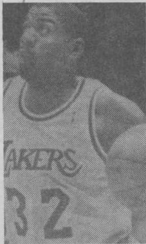
Earvin "Magic" Johnson

his pals -- led Michigan State to the NCAA title as a sophomore in 1979 and then declared for the NBA draft. The Lakers, owners of the No. 1 pick as the result of losing free agent Gail Goodrich to the Jazz three years earlier, grabbed the Magic man. Wouldn't you?