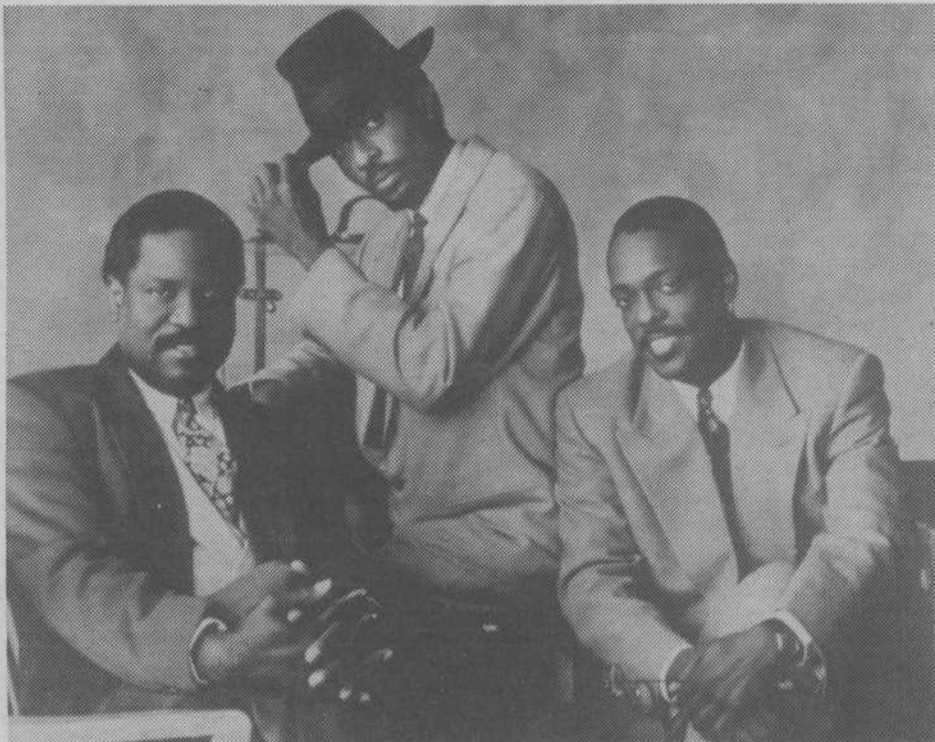
The Gap Band

While the new jacks are sure to once again look toward the Gap Band for some hit groove-making tips, that's all right with the Wilson brothers. "It doesn't bother us at all," says Ronnie. "We're still inventive. The original is always better than the copy."