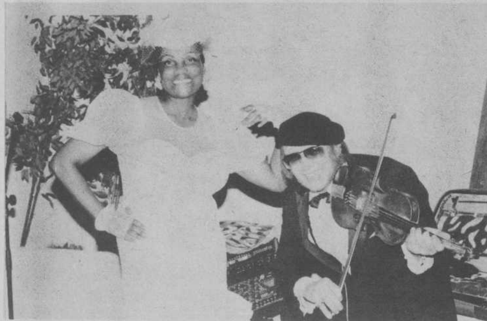
The Last Generation