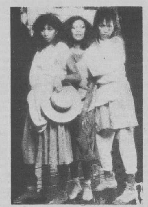
The Pointer Sisters

Just in time for Independence Day festivities, Ruth, Anita and June Pointer return to headline the Caesars Palace showroom - a trio of sparklers who have covered the full range of popular music with inimitable grace and style.