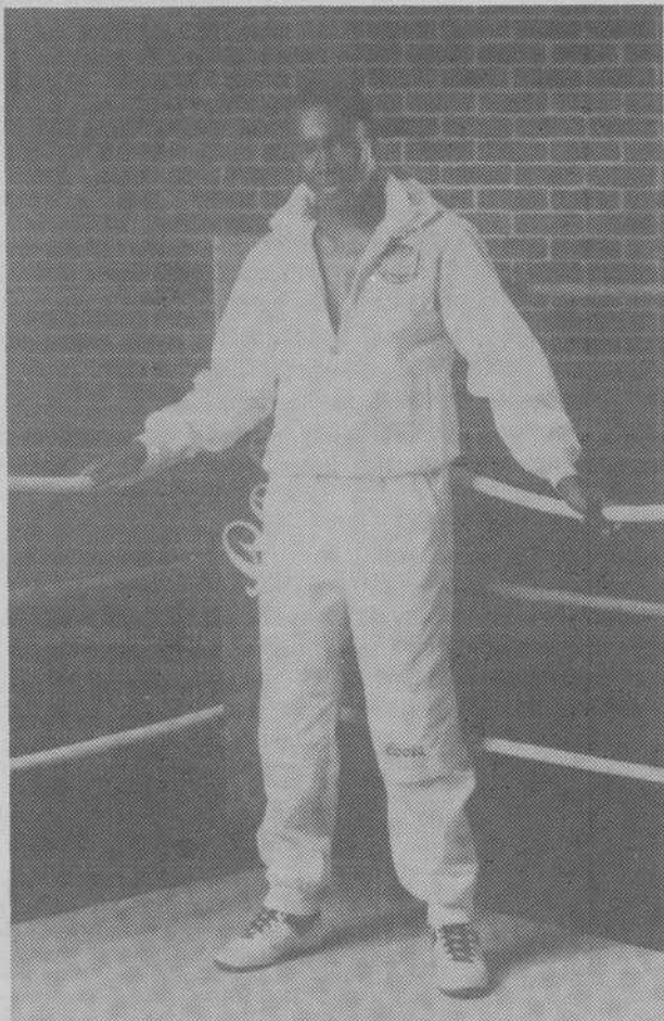
Sugar Ray in new line of sportswear.

From mid-June through the remainder of 1988, customers can obtain items through mail-in order forms mounted on life-sized Sugar