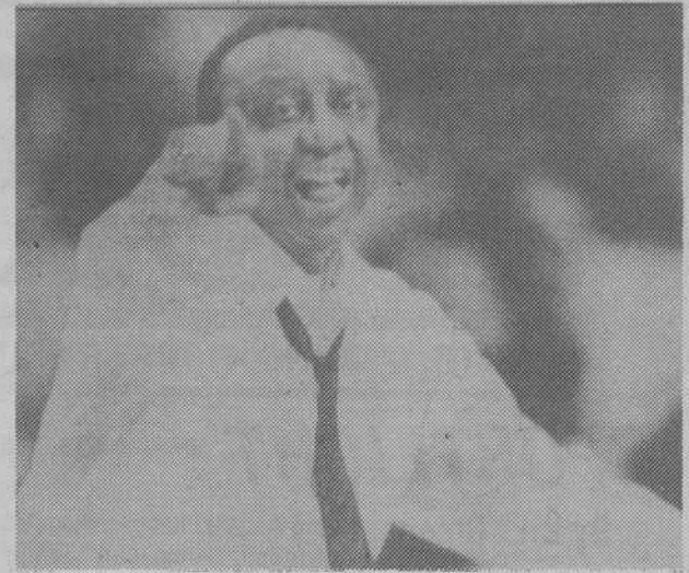
COACH OF THE YEAR - Temple University's John Chaney was honored by the Associated Press Friday as college basketball's Coach of the Year.