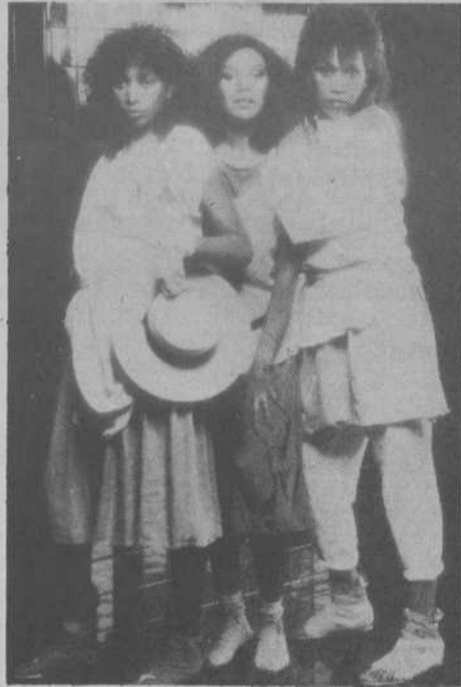
The Pointer Sisters

The Pointers drew critical acclaim. Their first two albums were certified gold, and they won a Grammy for country single "Fairy Tale." Because of the single, they became the first black female