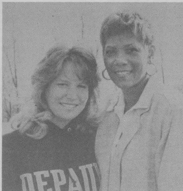
Pictured, right, Olympian Wilma Rudolph, track director and recruitment consultant with DePauw student.

the general public about DePauw's stepped-up minority recruitment efforts and made numerous public appearances to speak personally to black families who are bringing their children to visit DePauw.