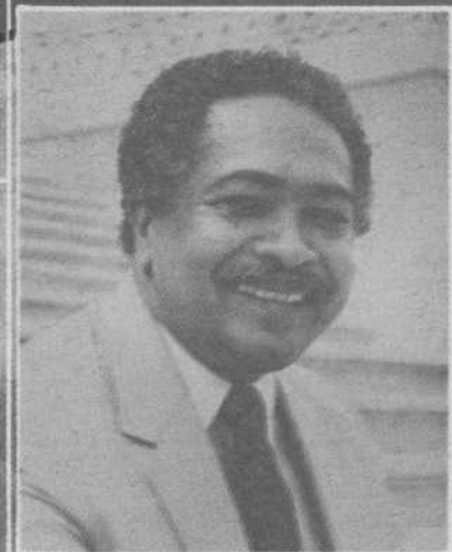
Congressman Mervyn M. Dymally Chairman, Congressional Black Caucus Chairman, Congressional Caucus On Science and Technology

"Pulling Ourselves Up By Our Own Bootstraps" ...A Series