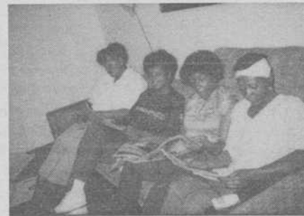
Scenes from AOIP Workshops