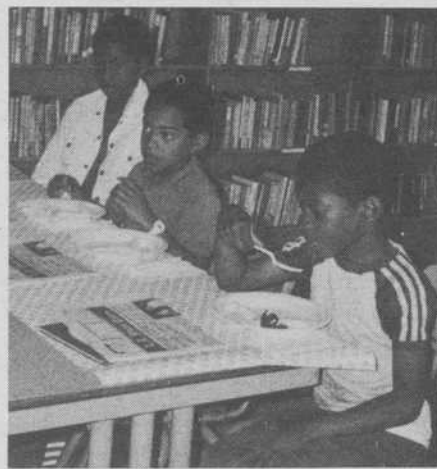
Refreshment time for students and AOIP Tutor, OR-LA-CO Branch

teacher or tutor from any program—with only a modest amount of special training—can be far more successful in teaching Black and other inner-city learners.