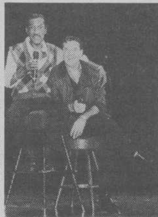
Sammy and Jerry

Though Davis is an accomplished recording artist and actor, he's at his best as a night club performer. As one critic observed, "The whole package of Sammy Davis can only be totally captured and appreciated live because he does more things and does them better than anyone in show business today." Jerry Lewis has of-