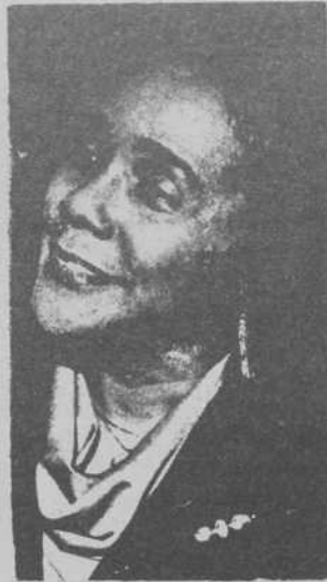
Coretta Scott King