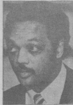
Rev. Jesse Jackson

The convention closes with the presentation of the coveted Spingarn Award, the highest honor the NAACP can bestow, to Percy E. Sutton,